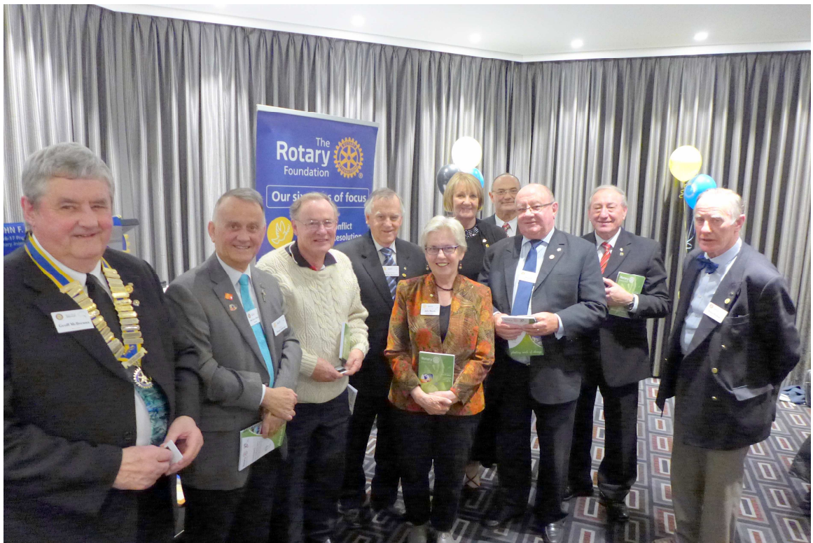
Board and Office 2016/17