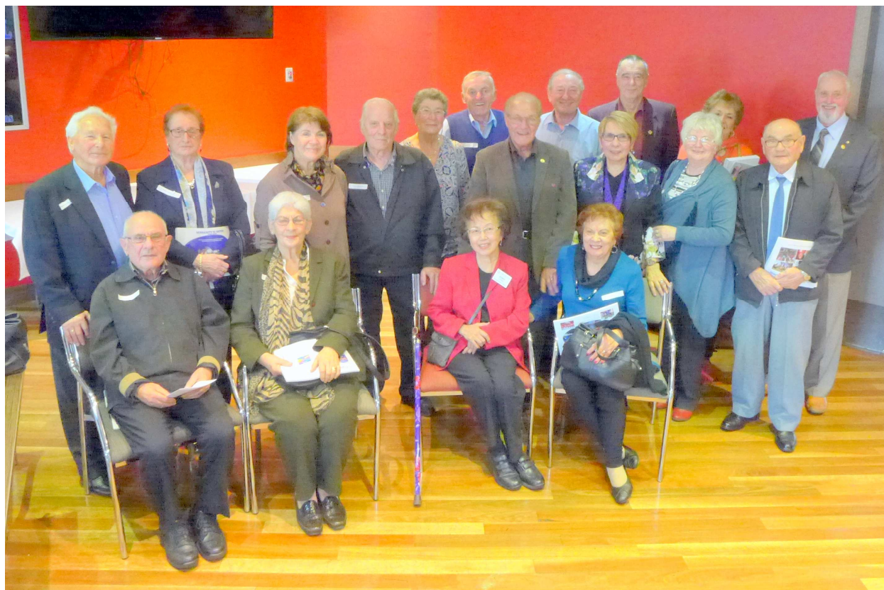
Il Coro Arcobaleno

DISTRICT CONFERENCE 2017: 16-19 March at Shepparton - Paradise Lakes Motel already booked for the Club.