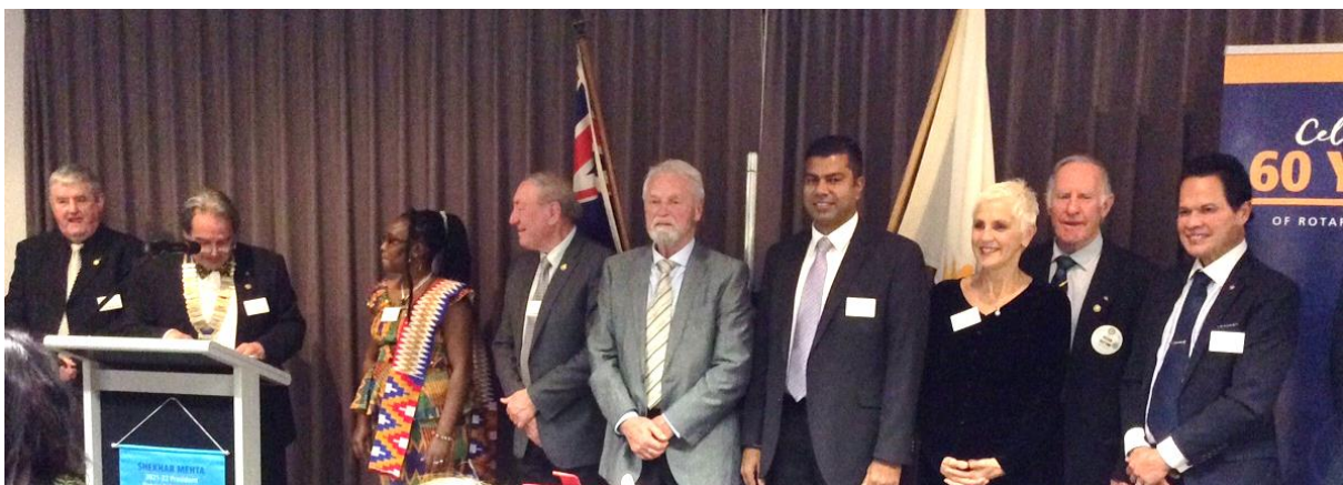
Preston Rotary Club Board 21-22